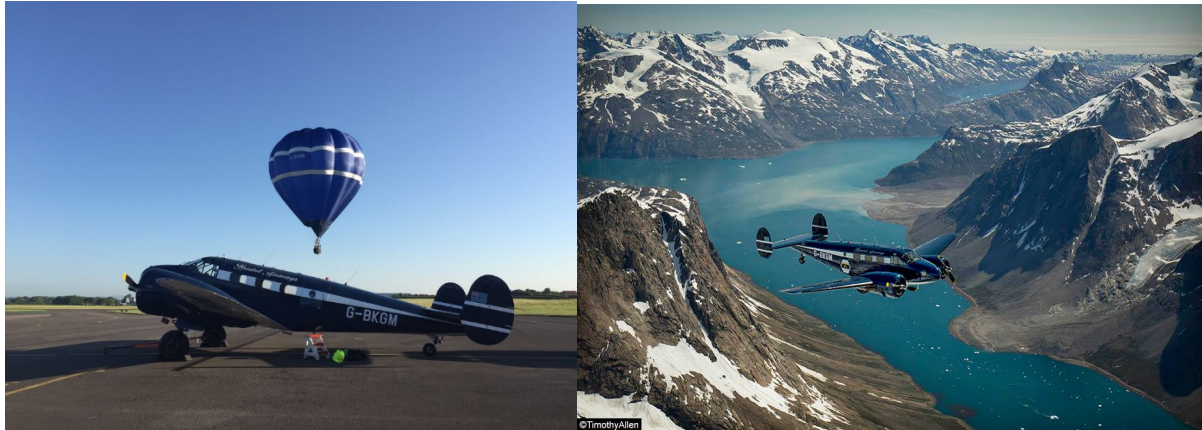
Phil and Allie's vintage Beech 18 and their ultra-light balloon preparing for their Arctic expedition in 2017 at Gloucestershire Airport – and a dream come true: flying across Greenland with the balloon on board the aircraft.

'It does not matter how slowly you go as long as you don't stop' - Confucius